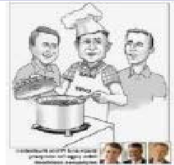
Men's cooking Classes